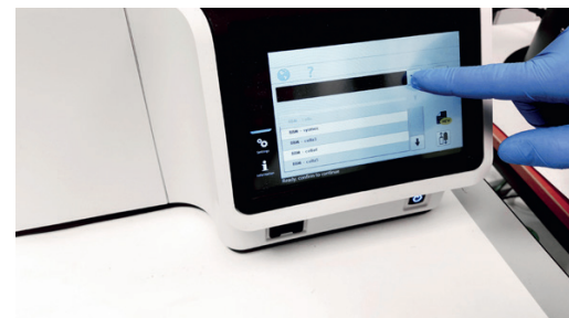
Pre-programmed staining protocols

RAL StainBox is a closed system that must be paired with one of the associated staining kits. They are methanol-free and reduce staff exposure to toxic chemicals. They are also ready to use, removing the need to mix or dilute reagents. Staining up to 300 slides, each kit can be used for 28 days after being opened.